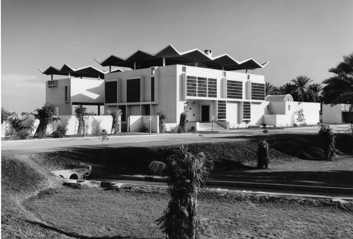
United States Embassy, Baghdad, 1960.