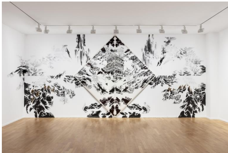
Abdelkader Benchamma, Cosma , 2023. Exhibition view, Templon, Paris, 2023. Photo: Tanguy Beurdeley. Courtesy the artist and TEMPLON, Paris – Brussels – New York.

Envisioned as a geological epic of our universe, Solastalgia: Archaeologies of Loss is a solo exhibition by French artist Abdelkader Benchamma that conjures enigmatic worlds and elemental forces at the precipice of transformation, evoking a yearning for worlds yet to be. Like an archaeologist, Benchamma unearths symbols across mythologies and legends inscribed by humanity onto the land, sky, and celestial bodies to create an elusive topography of dreams.