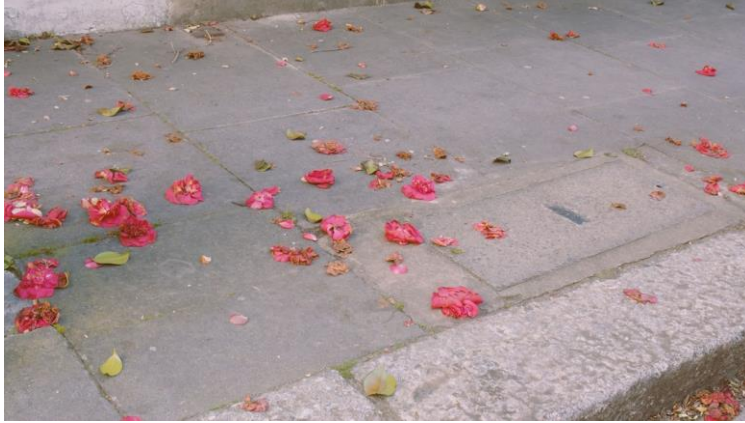
Erdem Taşdelen, still from A Moving Target , 2021–22. Computer-generated montage sequence with 100 silent UHD videos, approx. 1:40:00.

“This summer, we are delighted to be exhibiting eight artists demonstrating the breadth and strength of the contemporary art landscape of Canada today. Encompassing both established artists and those earlier in their career, this season offers a variety of inspirations and opportunities to engage in conversations on the pressing issues of our time.”